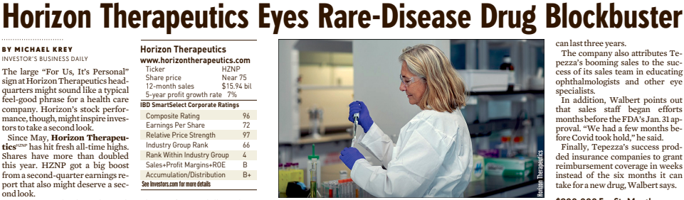
rizon focuses on researching, developing ar es for people impacted by rare and rheum atic d

hit $754 million in 2020. Furthermore, "upside is still pos-